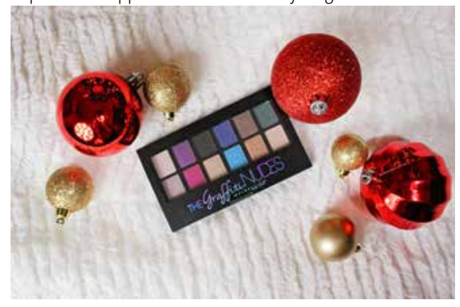
Maybelline Graffiti Nudes Palette

As the ultimate lightweight body-boosting leave-in treatment for thicker, fuller looking hair, Viviscal Densifying Elixir improves the appearance of hair all day long.