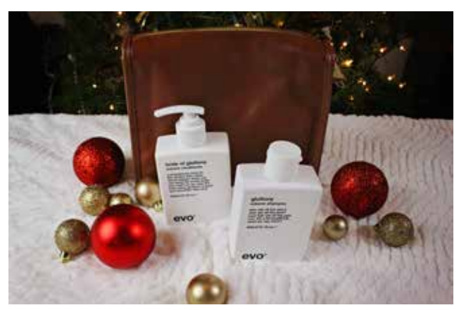
evo Live Large Volume Rad Bag

Four uses in 1 sponge! One little sponge can help fix nearly all face makeup mistakes. Purchase at your local Ulta or get these Miracle Mini Erasers online.