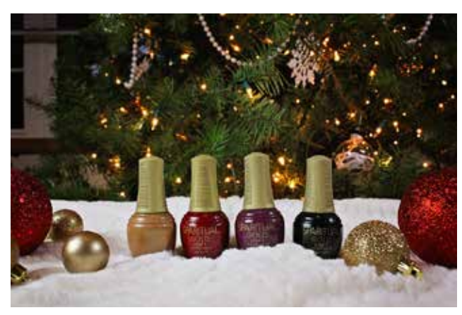
SpaRituals Holiday Vegan Gold Collection

Gorgeous collection of polishes that will work all winter long. Great coverage and a welcome sight for anyone who loves a pretty polished nail. More about the 2016 Holiday Collection.