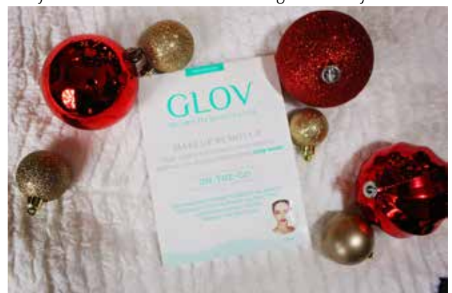
GLOV On-The-Go Makeup Remover

With a combination of oils and extracts, the WEN ReMoist Hydrating Mask leaves hair silky, soft, and replenished after every use. Perfect for someone looking to treat dry hair.