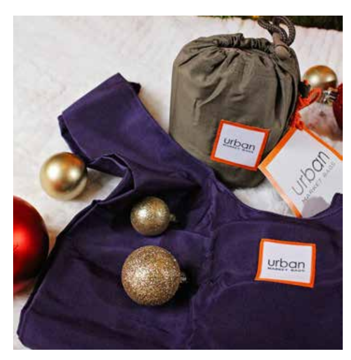
Urban Market Bags The hostess with the mostess certainly does a lot of trips to the market. <u>Urban Market Bags</u> would make a great hostess gift because they're easy to pack, wash, use and reuse.