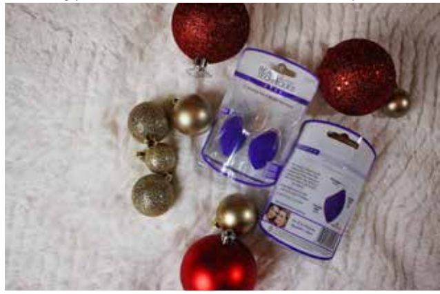
Real Techniques Mini Erasers

Your favorite facial tissue company has come out with facial cleansing products too! <u>Purchase these exclusively online.</u>