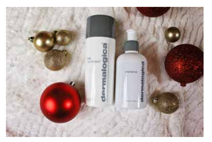
Dermalogica Skin Brightening Duo Gift Set

Inspired by the urban street art shades, edgy brights take on the city! From fierce purples to acid rain blue, this Ulta Beauty exclusive palette is sure to stun! Find at <u>Ulta.com</u>.