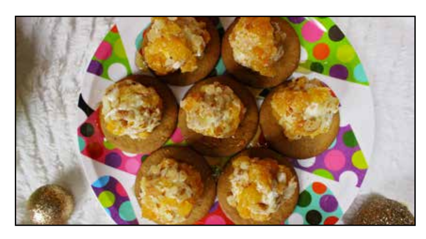
Fast and Delicious Holiday Appetizer — Page # 15

Thank you for downloading this gift guide + free printables. Enjoy!