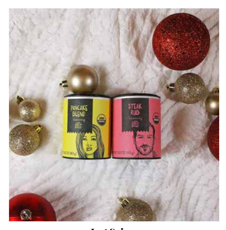
Just Spices Give the gift of some extra spice in your hostesses life. Spices are fabulous hostess gifts. Keep some in stock in your gift closet to print to impromptu dinner parties. Buy at <a href="https://www.lustSpices.com">www.lustSpices.com</a>.