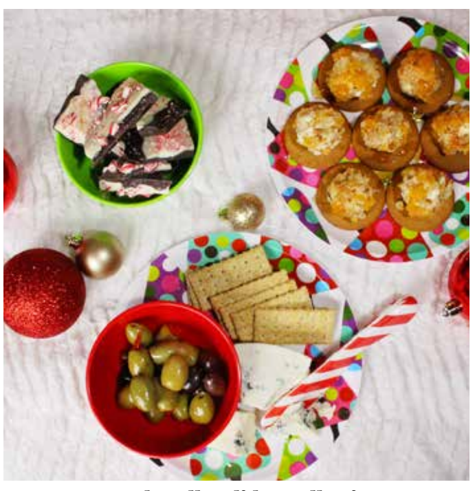
French Bull Holiday Collection French Bull's tableware is known for bright color schemes and beautiful designs. The holiday collection comes packaged with dangling ornaments, gift tags, and are ready for gifting.