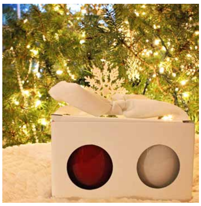
glassybaby Naughty & Nice Candle Holders Beautiful handblown votive candle holders with the extra benefit of giving a portion of each purchase to great causes. <u>Purchase online</u> or in a <u>glassbaby store near you.</u>