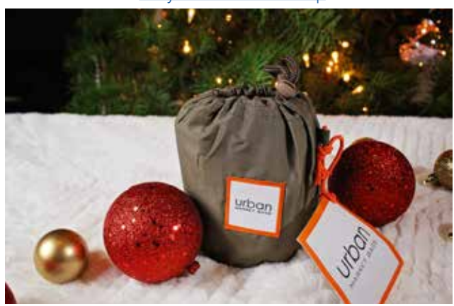
Urban Market Bags

When you need to dress for business, the Business Beanie gives you that classic look while keeping your head warm. Find at the <u>Helly Hanson online shop</u>.