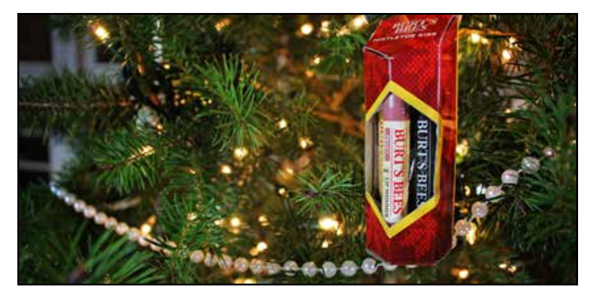
Unconventional Ways to Display Gifts—Page # 7