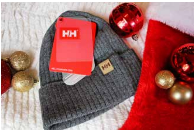
Helly Hanson Business Beanie for Him

Fitbit® Alta™ keeps you motivated and also looking great. Track your activity and take advantage of automatic recognition of select exercises. Get at <u>Verizon Wireless</u>.