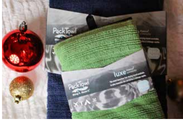
Luxe Towel from PackTowl

Spices don't have to be boring. Just Spices' U.S. portfolio offers a diverse selection of spices that will perk up a variety of dishes. Find them on <a href="https://www.lustSpices.com">www.lustSpices.com</a>.