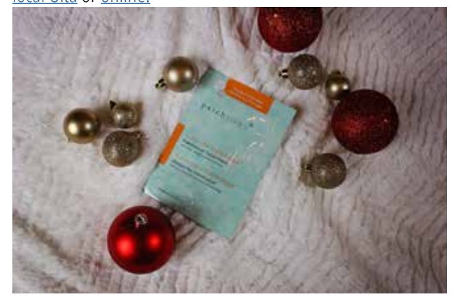
Patchology Illuminate FlashMasque

For an all year round bronzed look, use the buildable Vivid Baked Highlighter by Makeup Revolution. Purchase at your local Ulta or online.