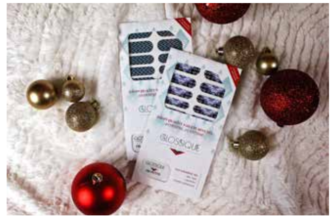
Glossique Nail Deco Wraps

Unlike other nail wraps these wraps go on in minutes and don't require heat setting. Pretty designs that fit perfectly in a stocking. Shop for Glossique online.