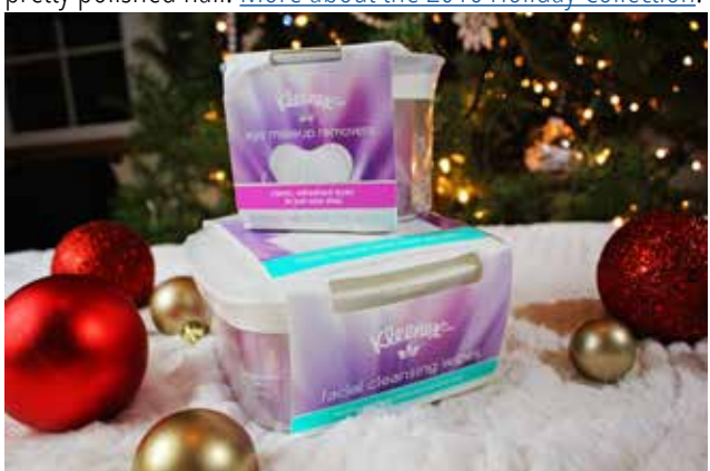
Kleenex Facial Cleaning Wipes & Eye Makeup Removers

Gorgeous collection of polishes that will work all winter long. Great coverage and a welcome sight for anyone who loves a pretty polished nail. More about the 2016 Holiday Collection.