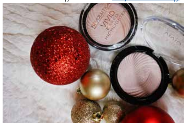
Makeup Revolution Vivid Baked Highlighter

Your hair never had this much personality. The evo hair products are dedicated to individuality and integrity. I love the names and the ingredients both! Get your own Rad Bag.