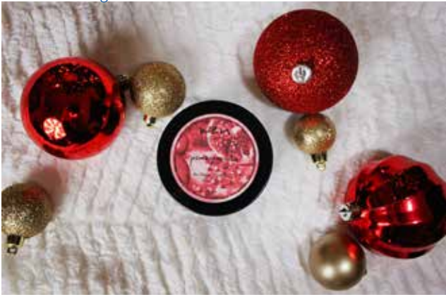
WEN ReMoist Hydrating Mask

Give the gift of clean and brighter skin with two of Dermalogica's best sellers, Daily Microfoliant + Precleanse. Find <u>Dermalogica at Ulta</u>.