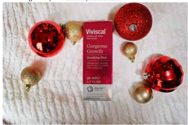
Viviscal Gorgeous Growth Densifying Elixir

Unlike other nail wraps these wraps go on in minutes and don't require heat setting. Pretty designs that fit perfectly in a stocking. Shop for Glossique online.